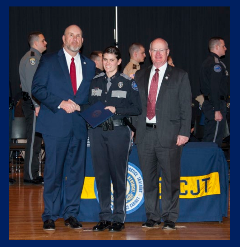
DOCJT Police Academy Graduation