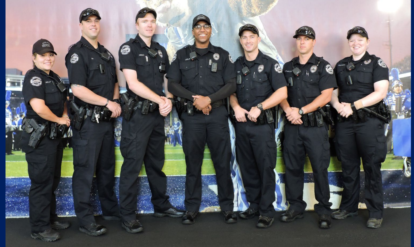
UK Police Officers during a UK Football Game